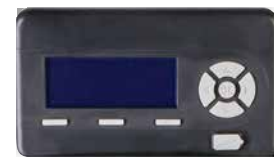
Integrated control with weather compensation