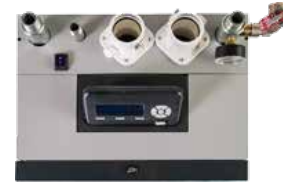
Top connections for easy installation