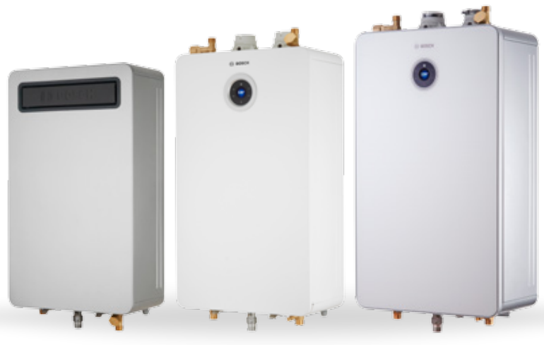
Greentherm T9800 SE outdoor